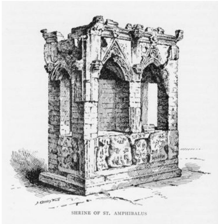
Illustration: Shrine of St. Amphibalus