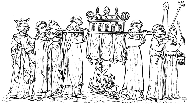
THE FERETORY OF ST. ALBAN Cottonian MS., Nero, D.I.